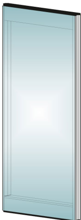
3D ISOMETRIC VIEW